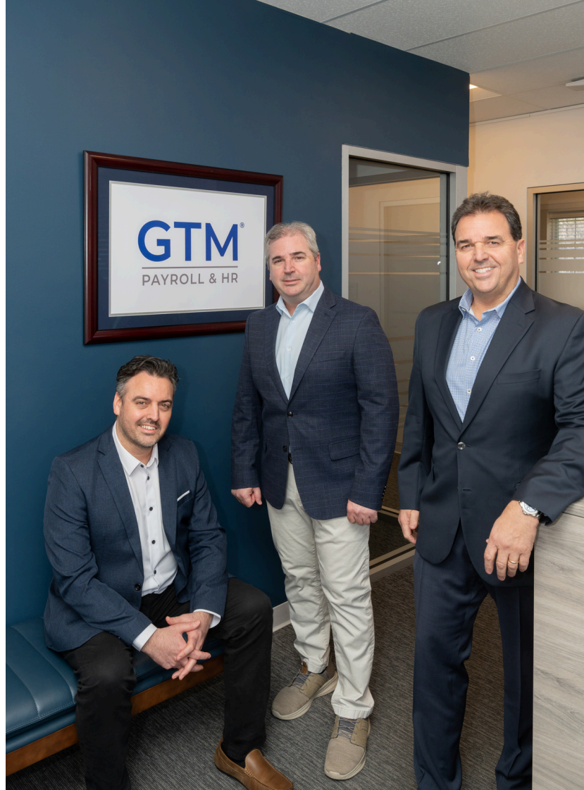
The GTM Executive Team

Learn more about how we can help you employ, enable, and empower your workforce today.